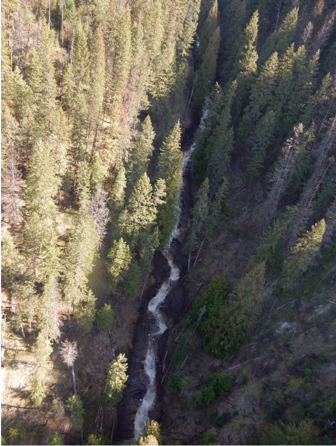
Figure 4. Debris flood path down Talbott Creek.