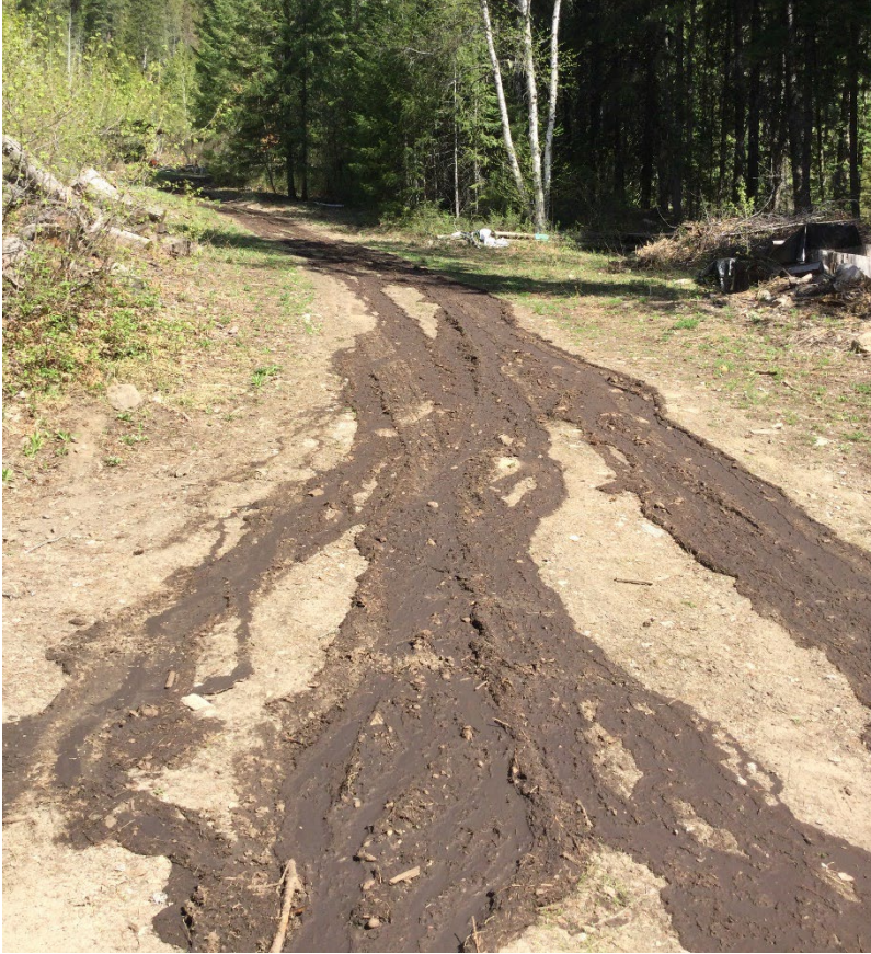
Figure 8. The runout of the small avulsion on Talbott Creek showing mud deposition along a private access road at 3279 Little Slovan South Road.