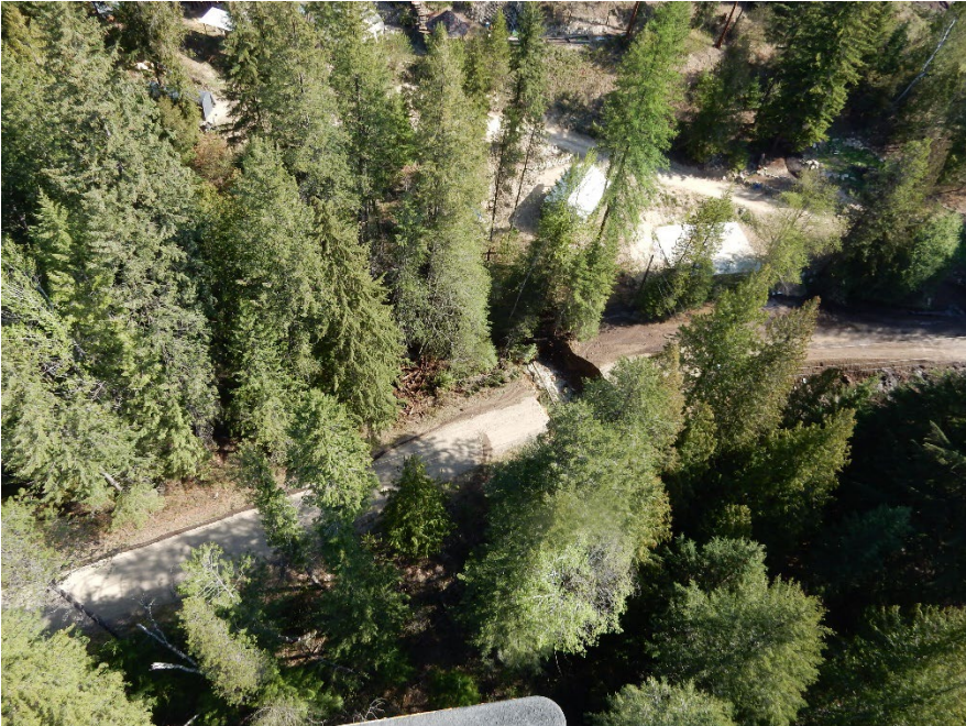
Figure 5. Talbott Creek at Little Slovan South Road.