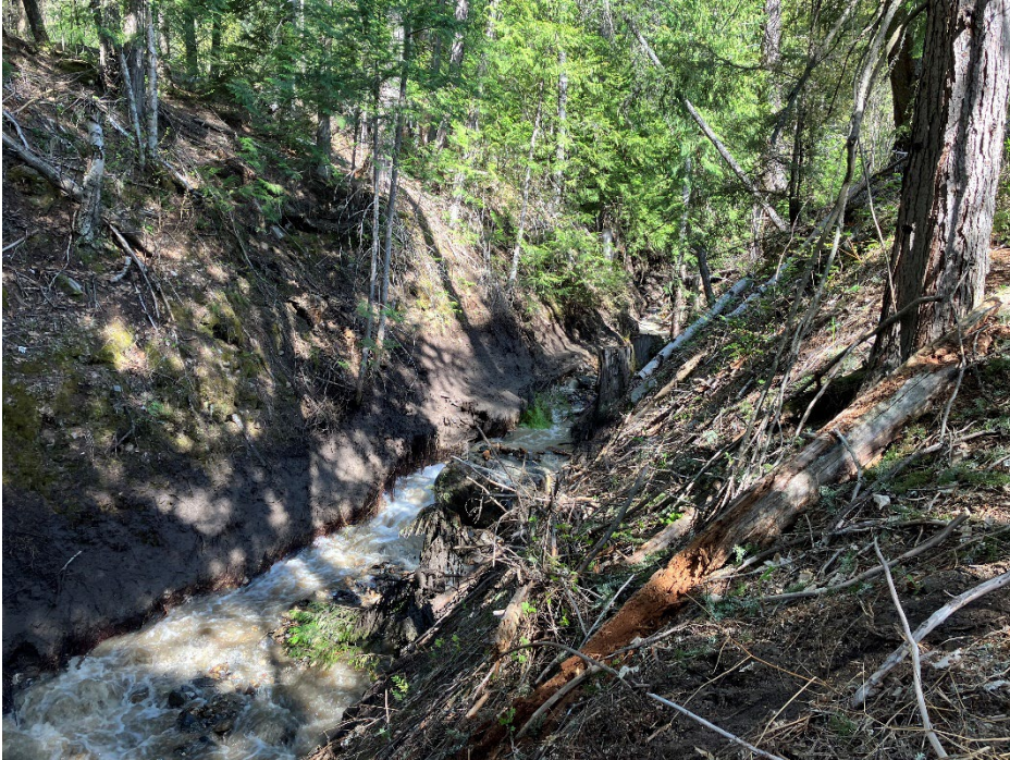
Figure 6. Talbott Creek upstream of the Little Slocan South Road.