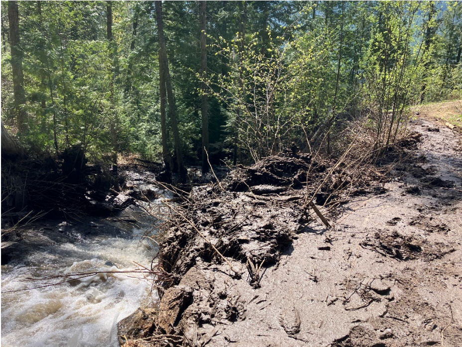
Figure 7. Talbott Creek at its fan apex with a small avulsion down a private road west of the channel.