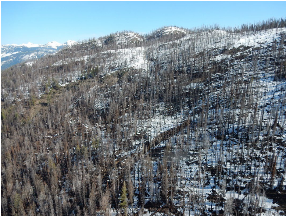
Figure 3. Oblique view looking west of the Talbott Creek debris slide.