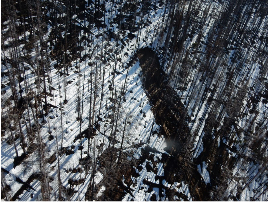
Figure 2. Headwall debris slide in the Talbott Creek watershed.